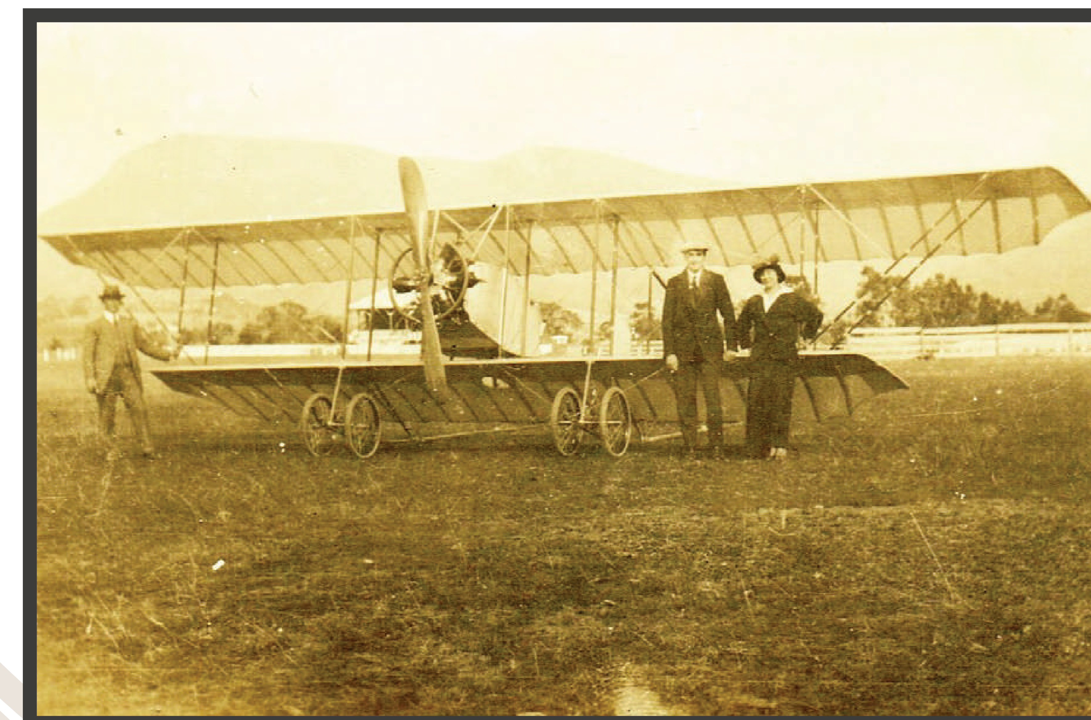
CIRCA 1914 FIRST FLIGHT

The first flight in Tasmania takes off from the Showgrounds, about 2000 spectators gathered on the grounds to see Delfosse Badgery's exhibition of flying.