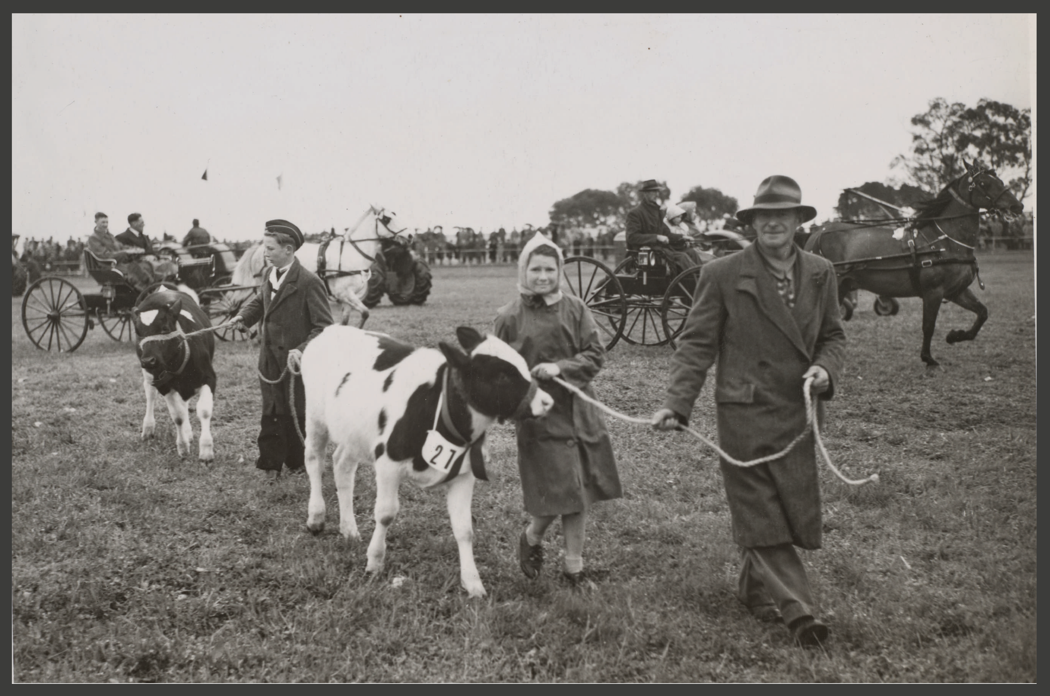
CIRCA 1880 GRAND PARADE AT HOBART SHOWGROUNDS