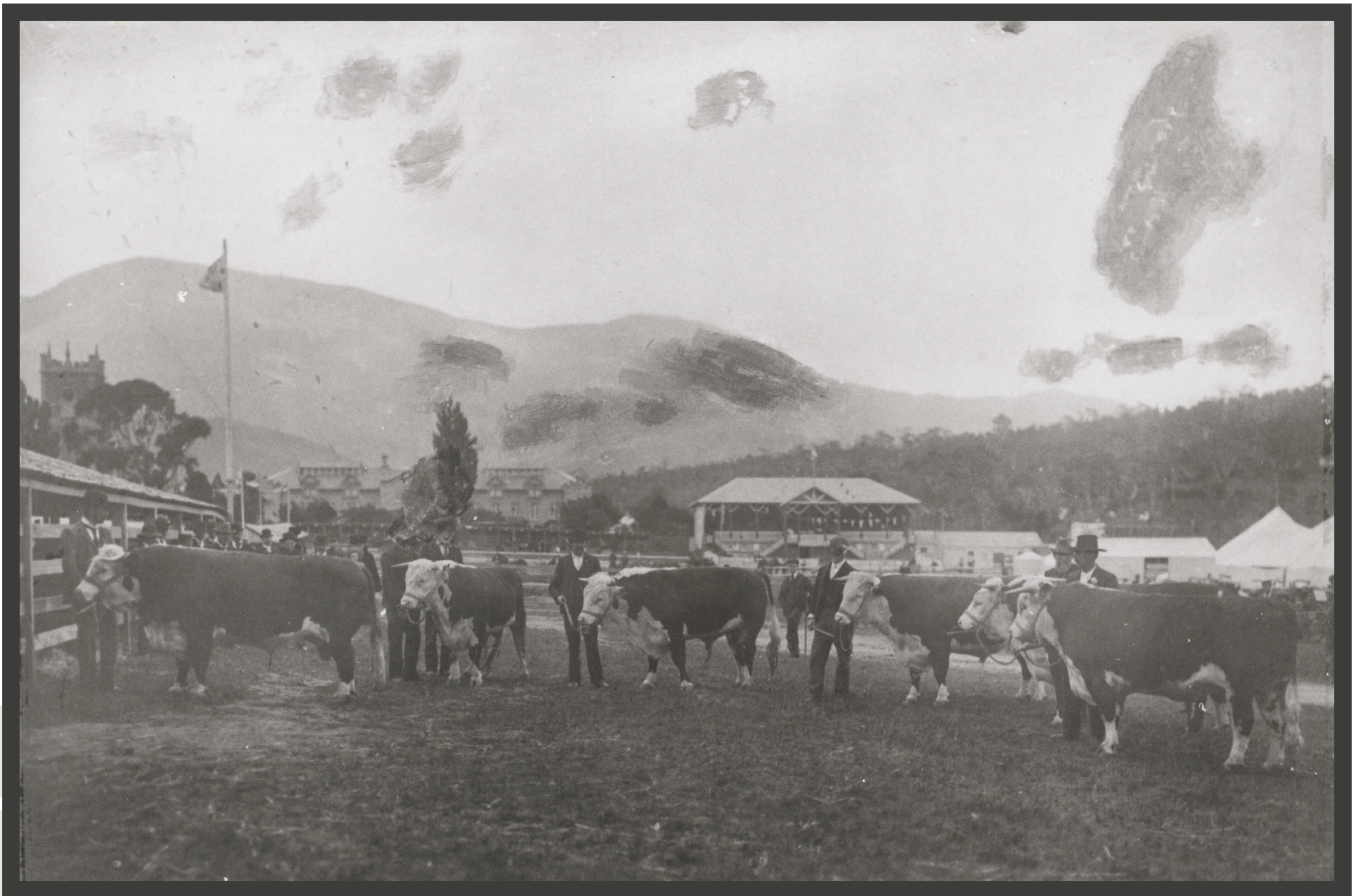
CIRCA 1880 NEW TOWN SHOWGROUND