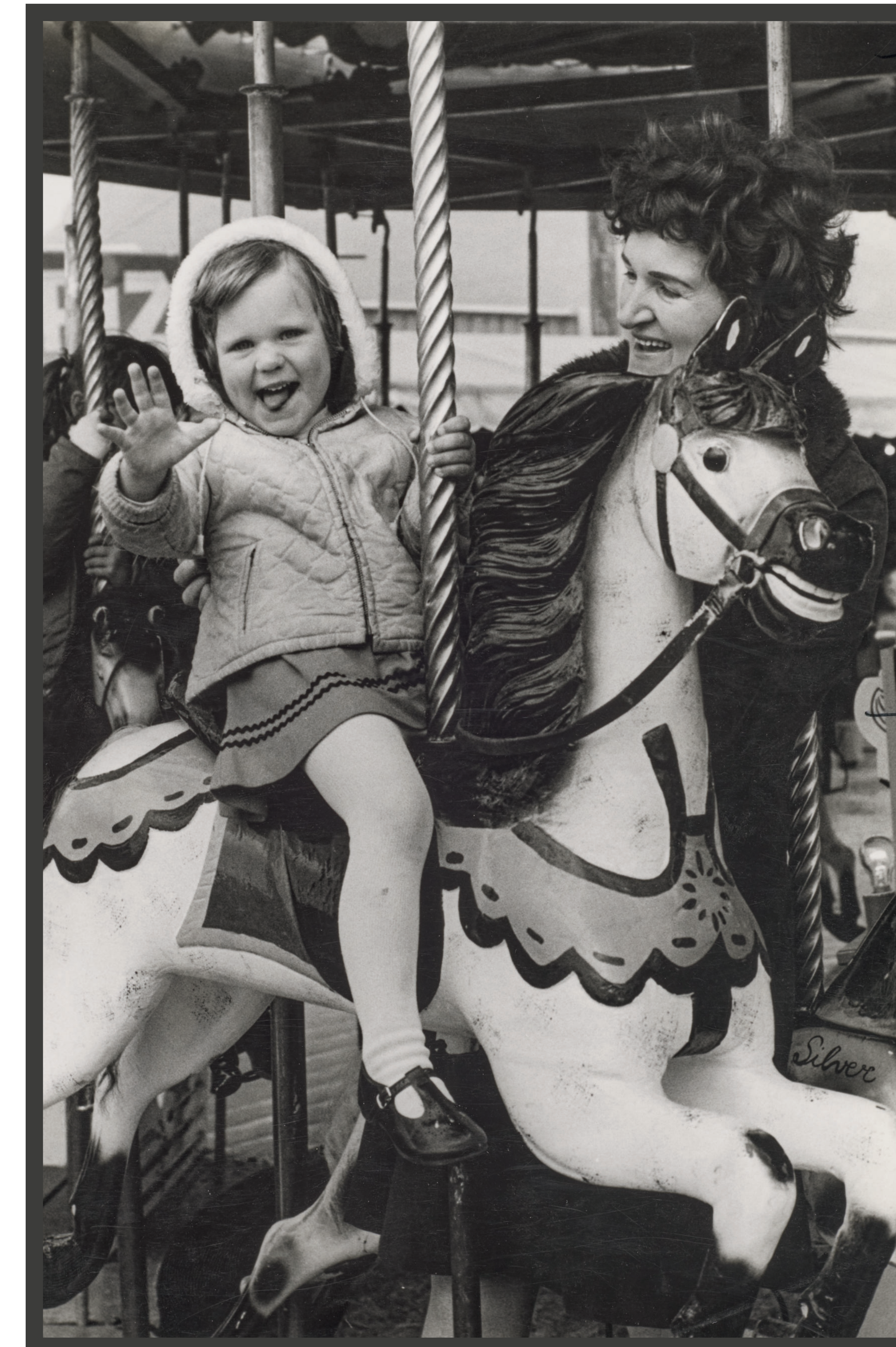
1979 SIDE SHOW

The Society held 2 Shows, an Autumn Show in April and a Spring Show in October.