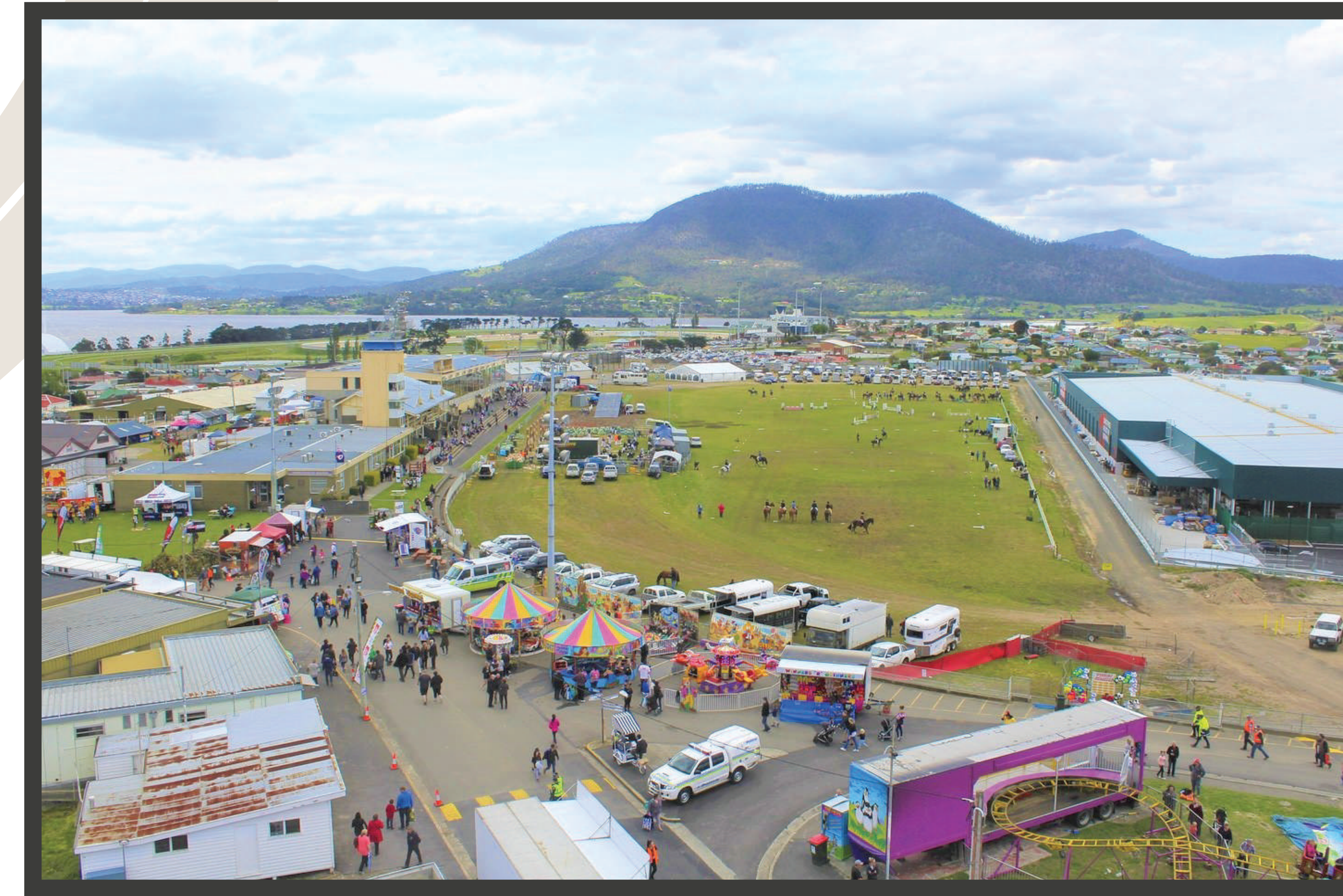
2016 ROYAL HOBART SHOW

Spotlight development paving the way for a major rejuvenation of the site, the Show, and the Society.