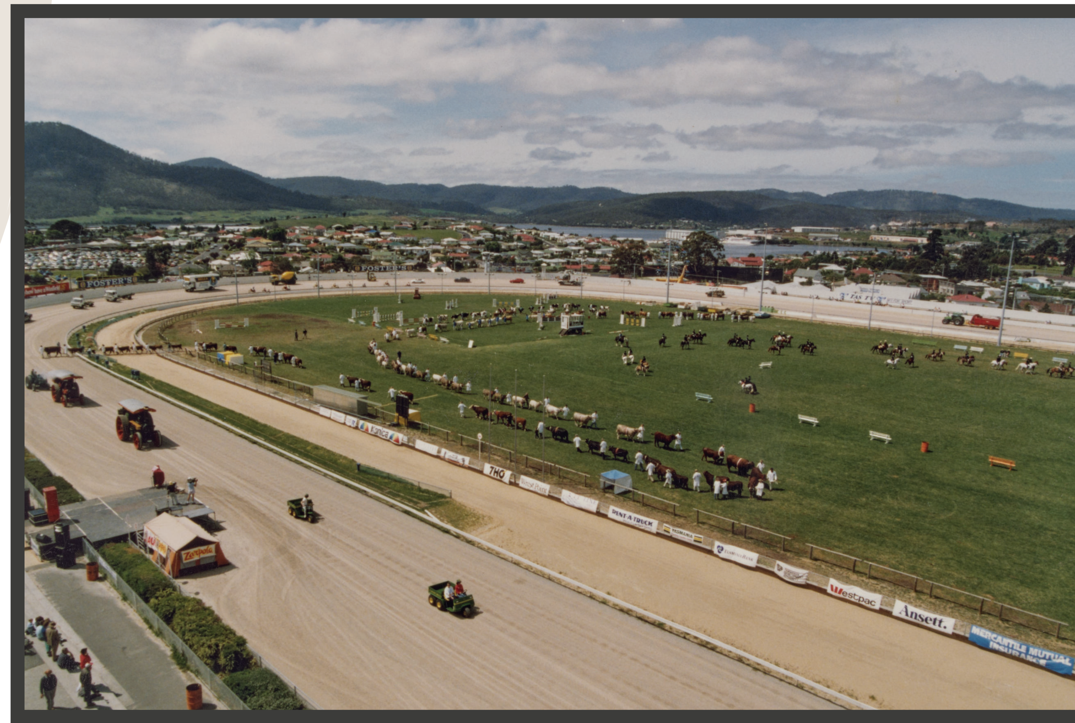
CIRCA 1990'S SHOW ARENA