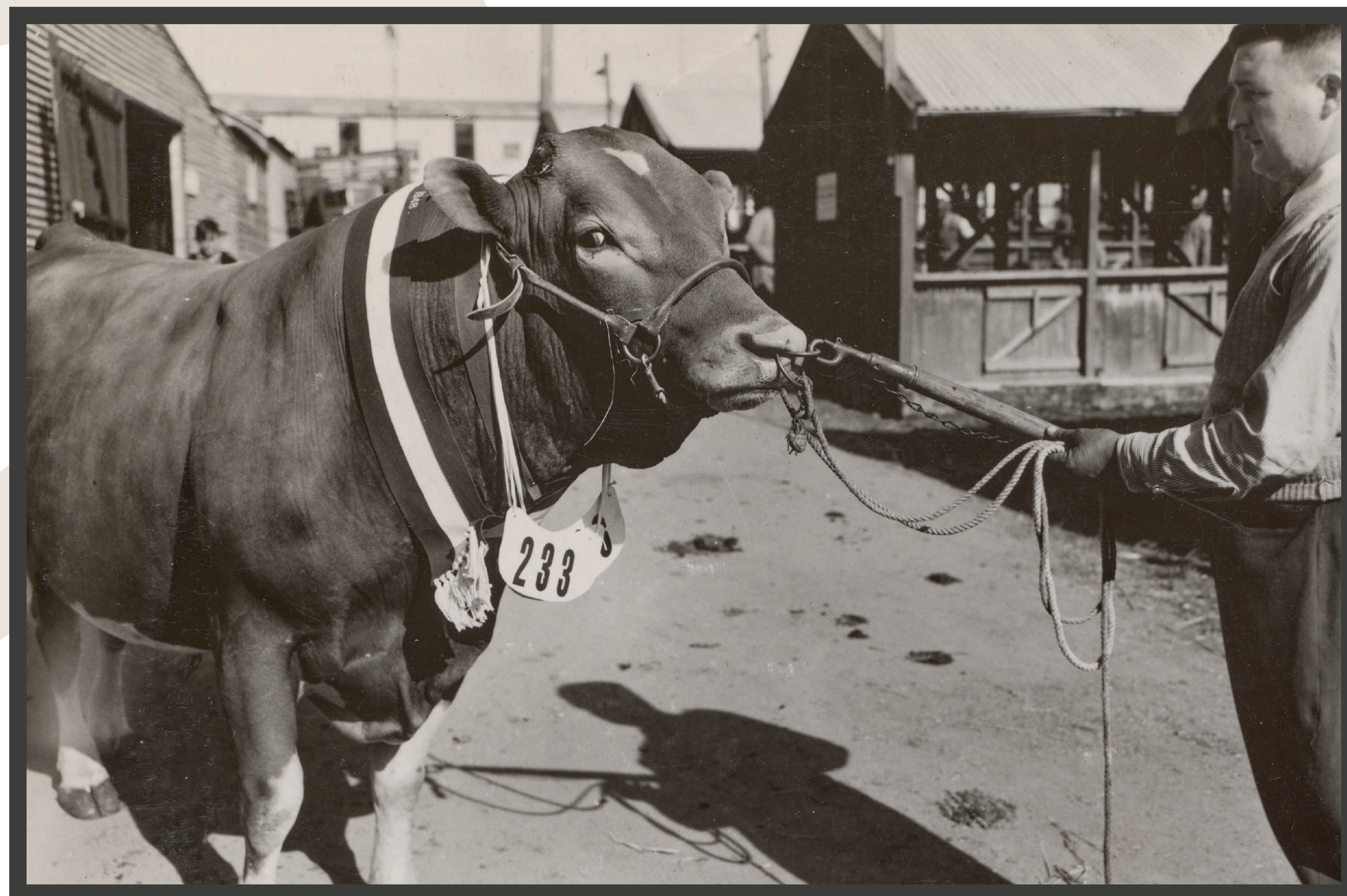
CIRCA 1900 SHOW BULL