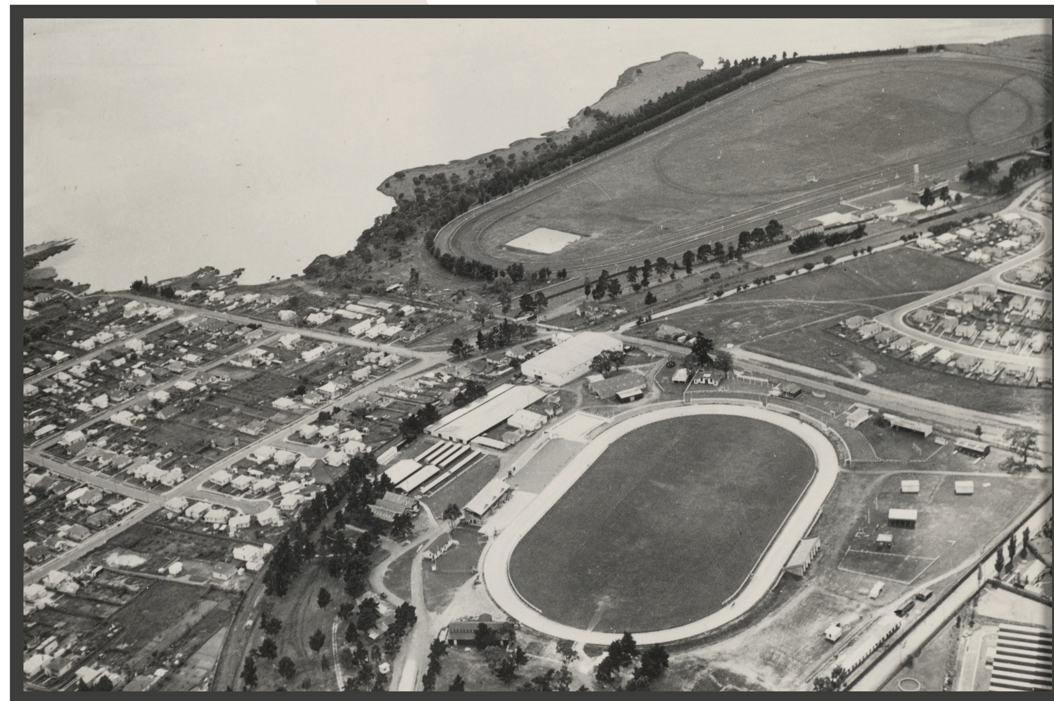
PRIOR TO 1967, AERIAL SHOT OF SHOWGROUND

His Royal Highness the Prince of Wales attends the Royal Hobart Show.