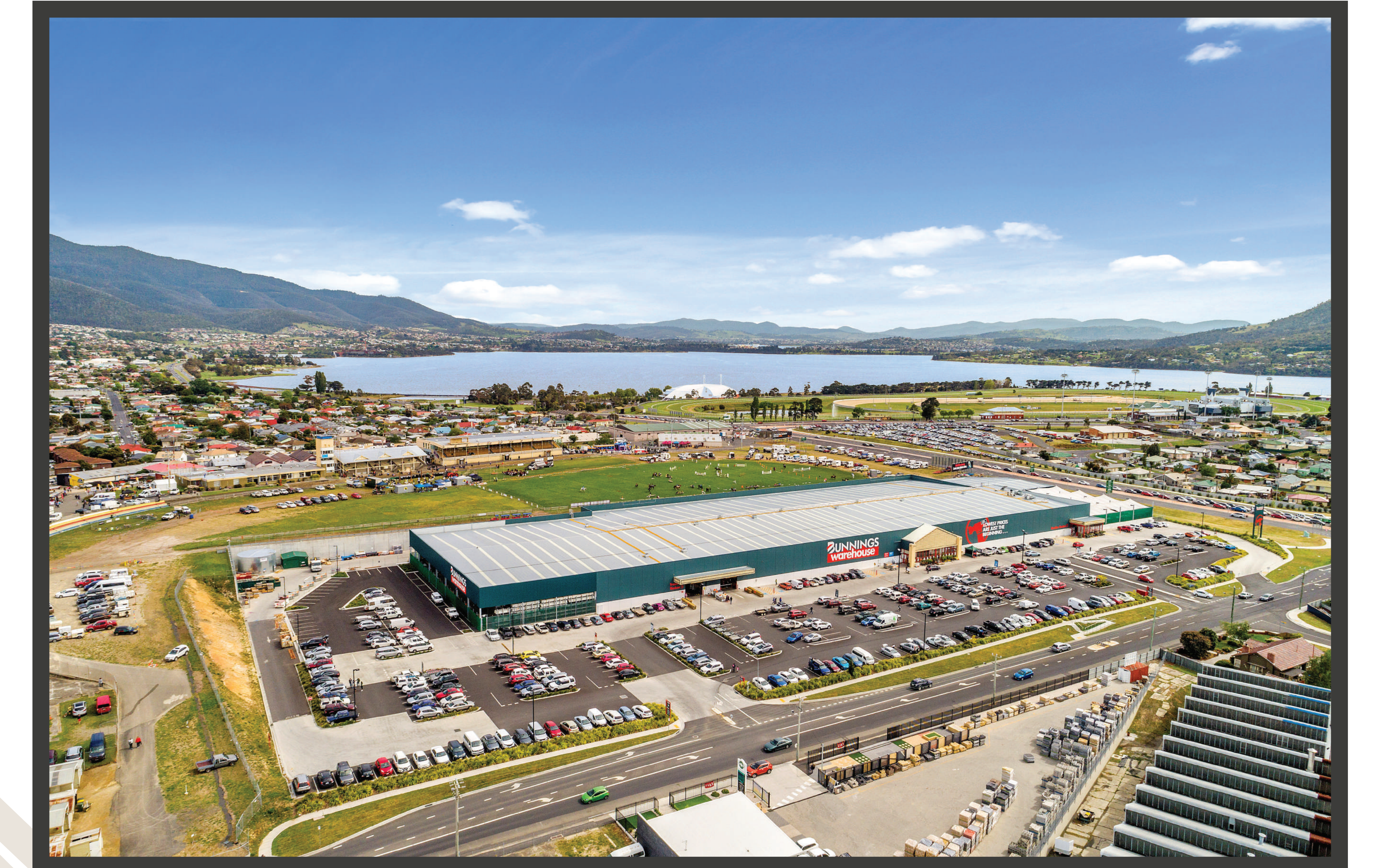
2016 BURGESS RAWSON SHOT

The Society celebrates their 200 Years of Showing.