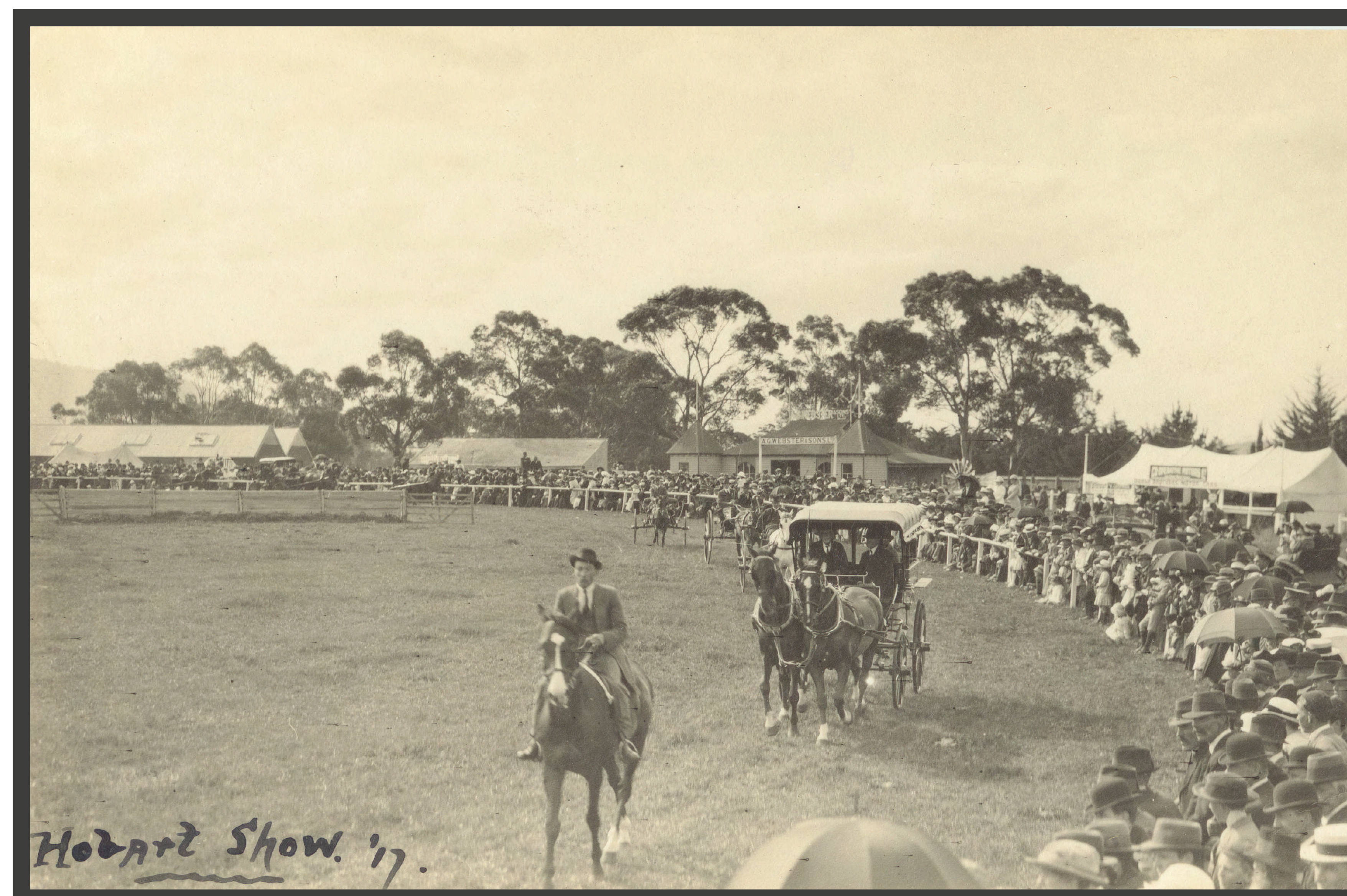
CIRCA 1917 HOBART SHOW

The Society hosted a Special General Meeting of members to discuss the proposal to purchase land in Glenorchy for use as permanent ground. The land, now known as The Hobart Showgrounds, was purchased for £2500.