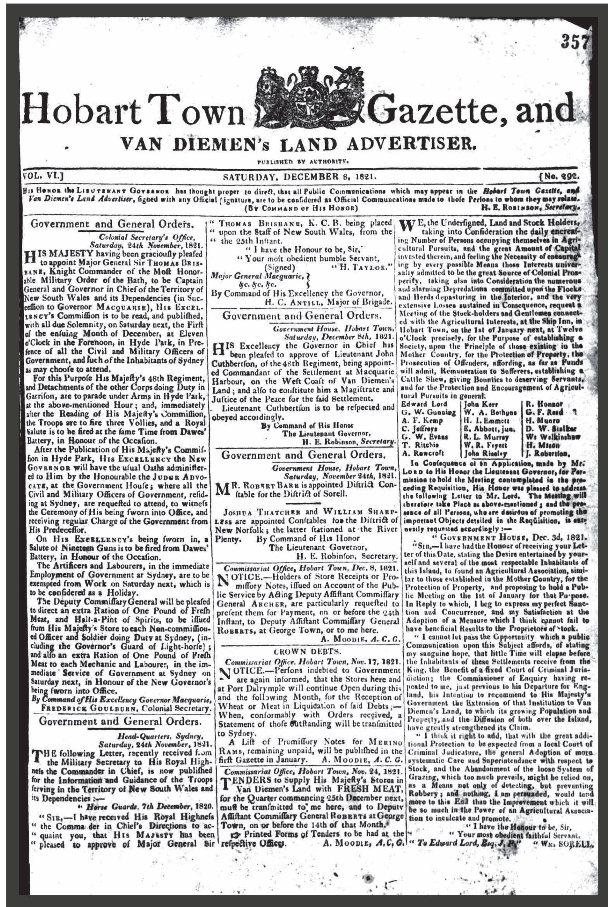
FIRST MEETING ARTICLE