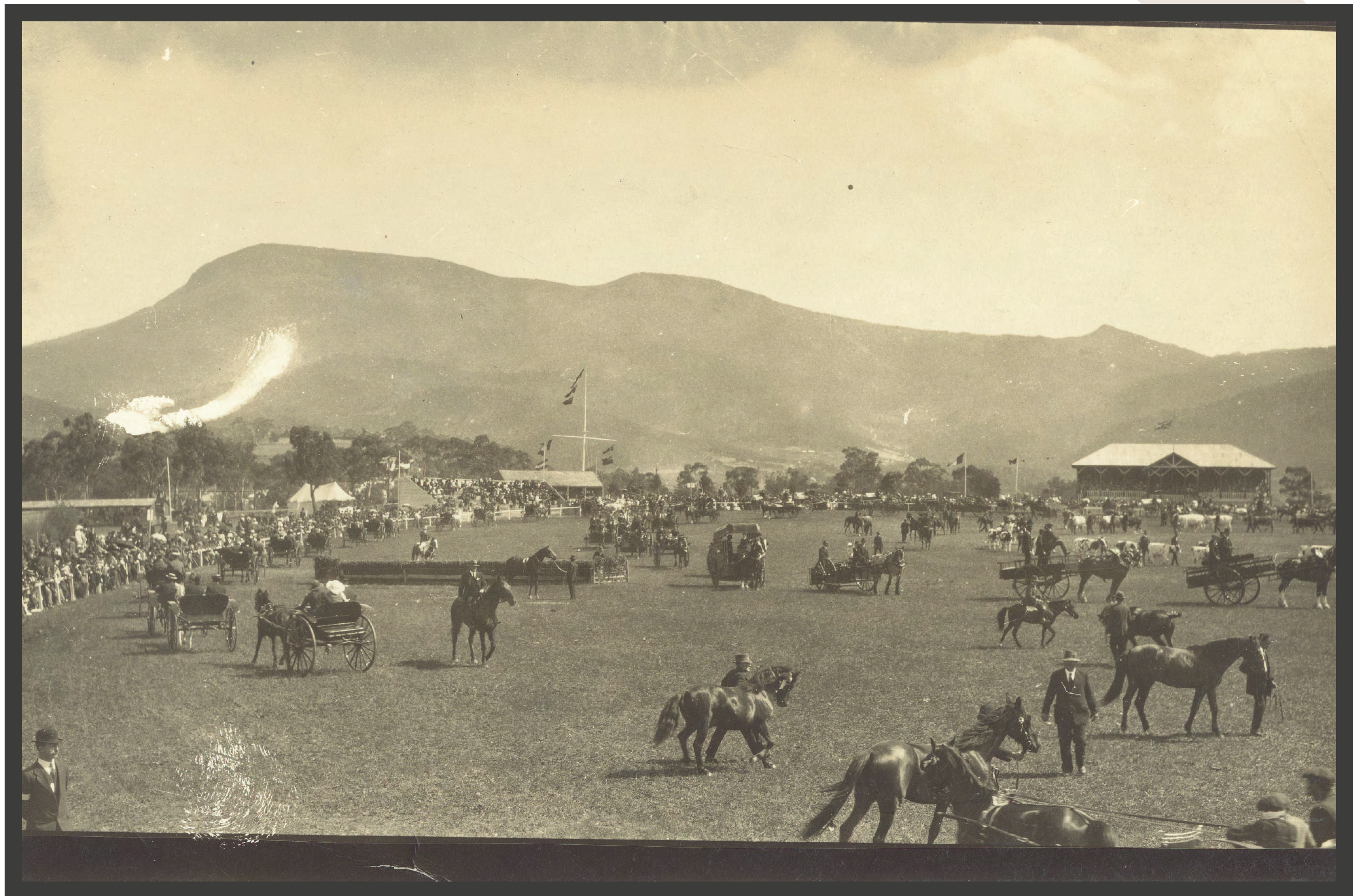
CIRCA LATE 1800S SHOW GRAND PARADE

THE ROYAL AGRICULTURAL SOCIETY OF TASMANIA