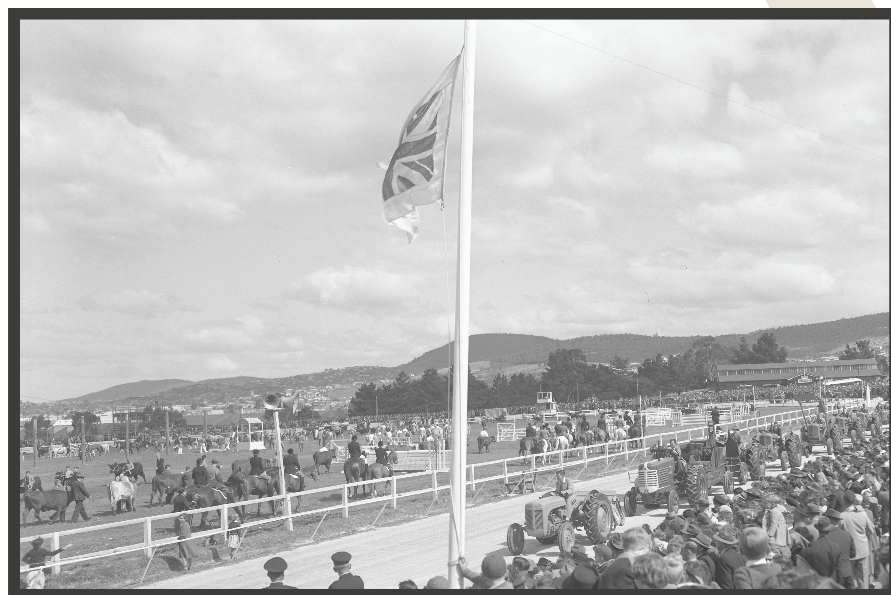
CIRCA 1900S SHOW

The Society held its first Show on the new Showground, the 50th Annual Spring Stock Show went over two days. The Show also held the very first poultry exhibit at an Agricultural Show in Tasmania.