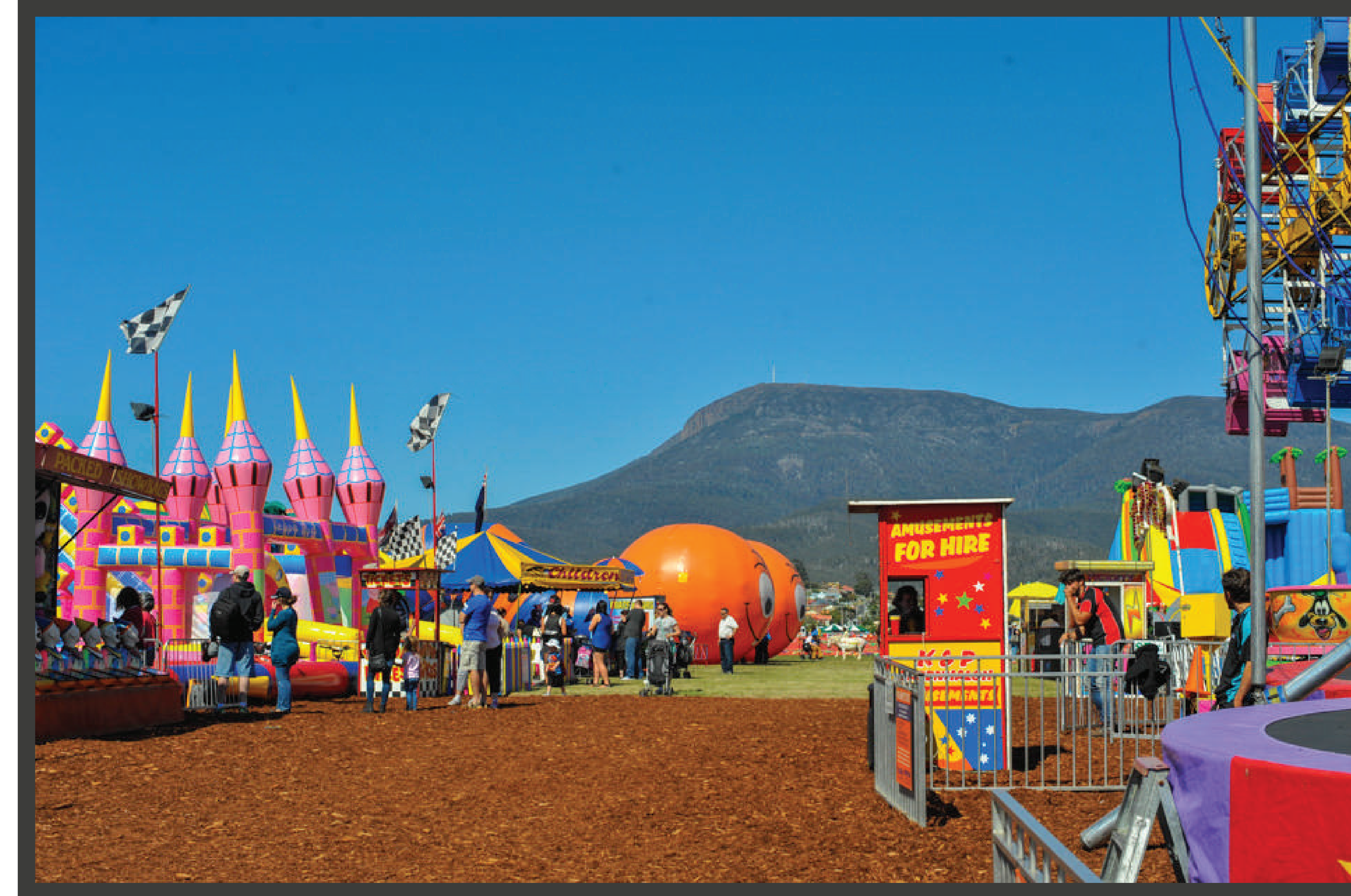
2014 CARNIVAL AT SHOW

Bunnings development signals financial security for the Society.