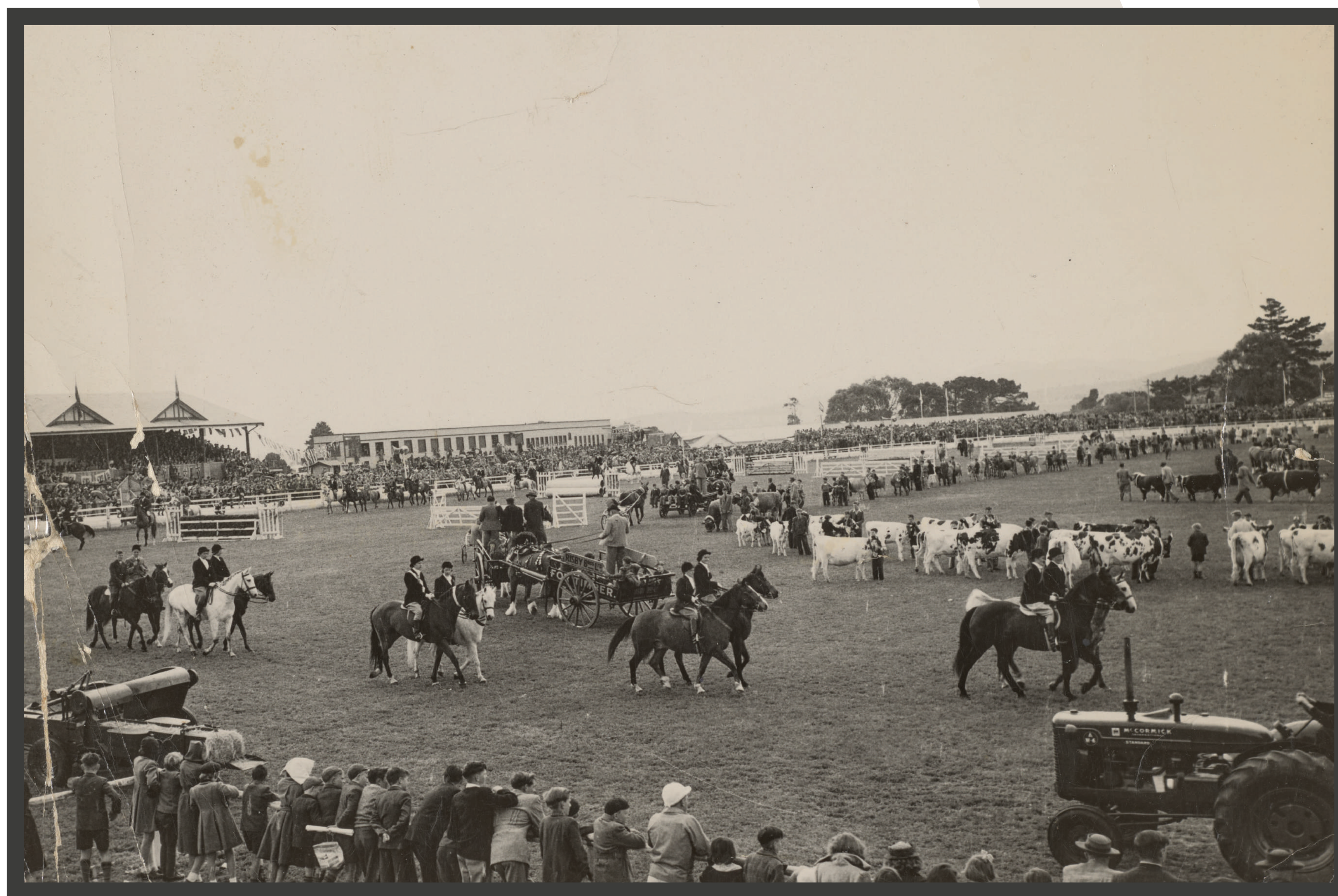
CIRCA 1873 GRAND PARADE

A meeting is held and the Society is reformed and renamed as Tasmania Agricultural, Pastoral and Horticultural Society.