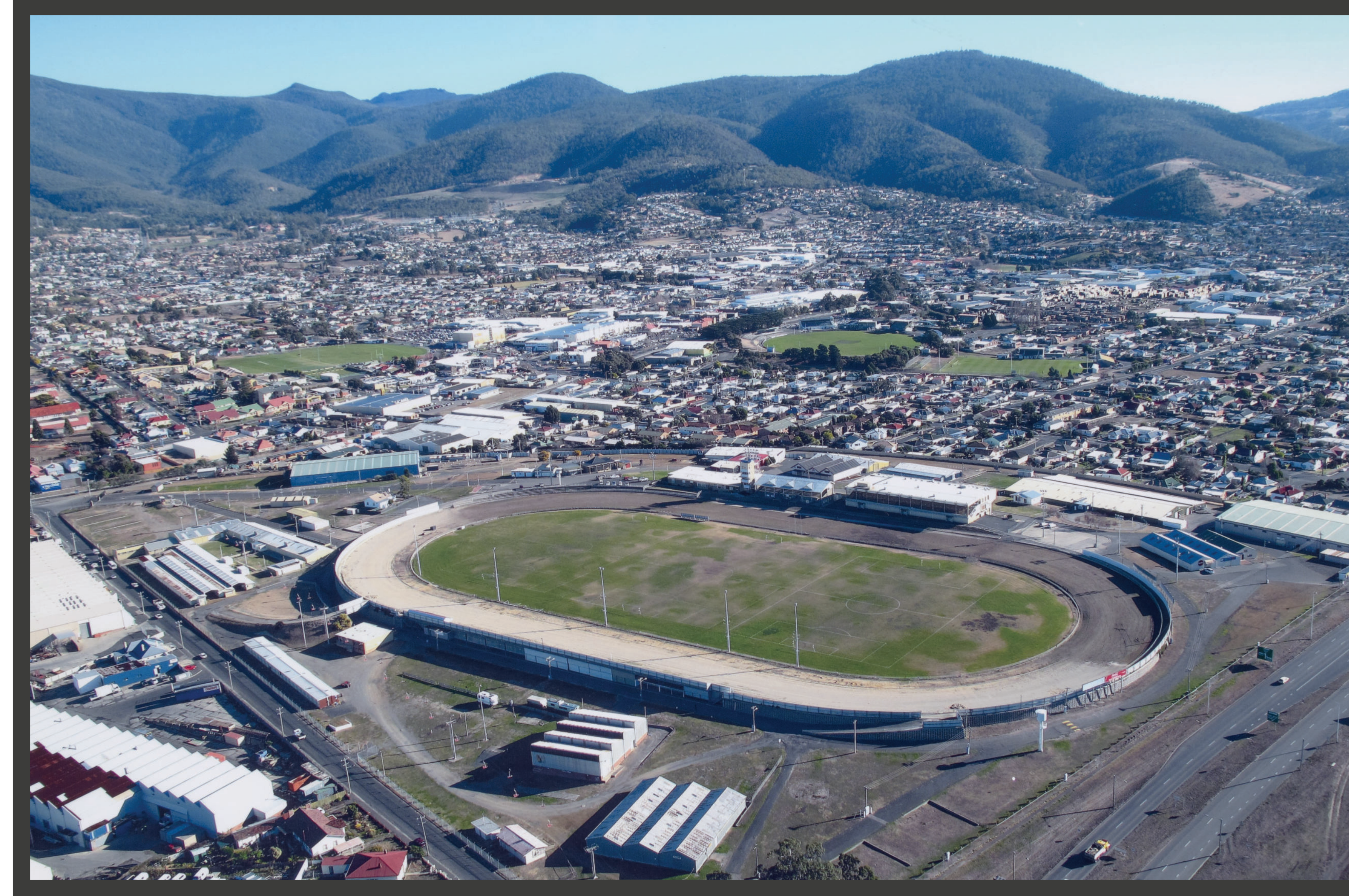
CIRCA 2000S AERIAL SHOT

The new (Main) Grandstand was built to facilitate the Inter-Dominion Pacing Championships.