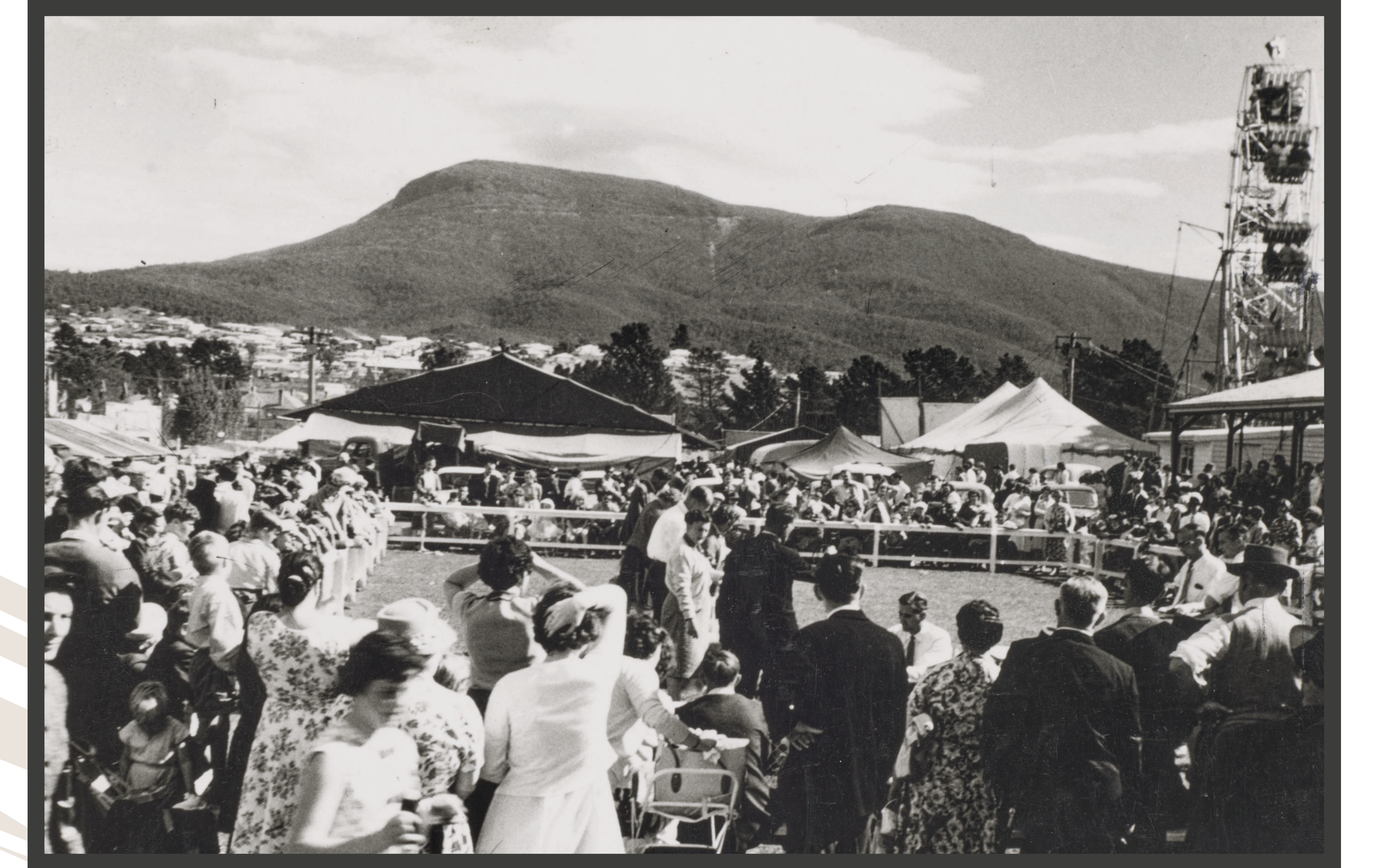
CIRCA LATE 1990S

A record 65,000 people attended the Royal Hobart Show.