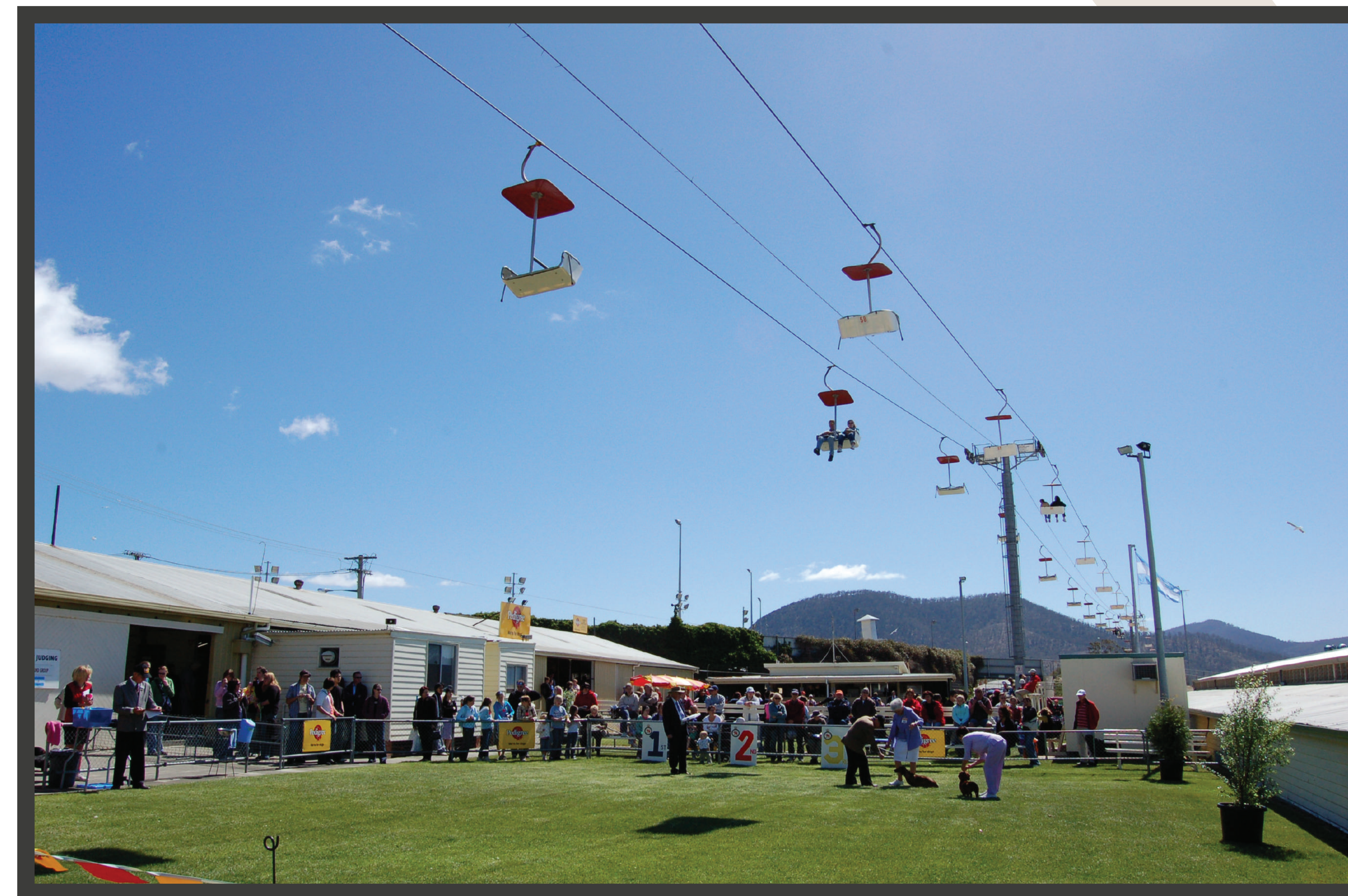
2006 KENNEL JUDGING RING AND CHAIR LIFT