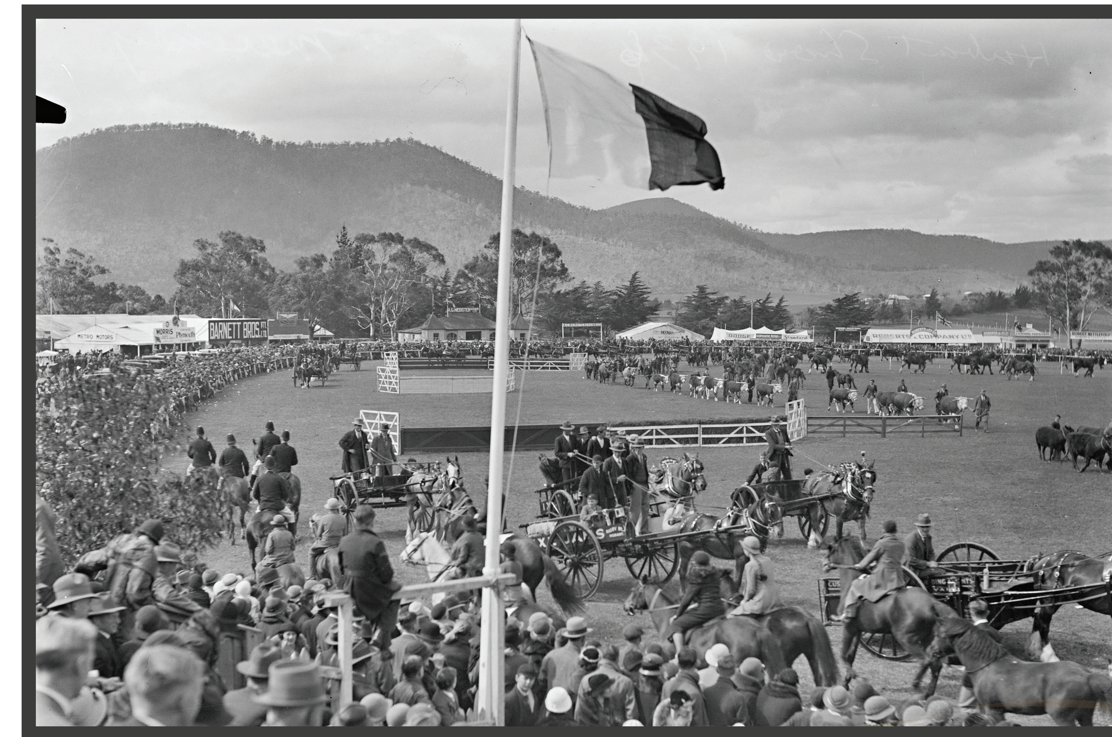
CIRCA 1900s SHOW DAY

The Society held its Annual Show at The Elwick Racecourse. This was the first Show held on these grounds, they showcased draught horses, light horses, cattle, sheep, wool, swine (pigs), dogs, machinery, ploughs (implements) and ploughing matches. Nearly 2000 patrons gathered on the grounds for the Show.