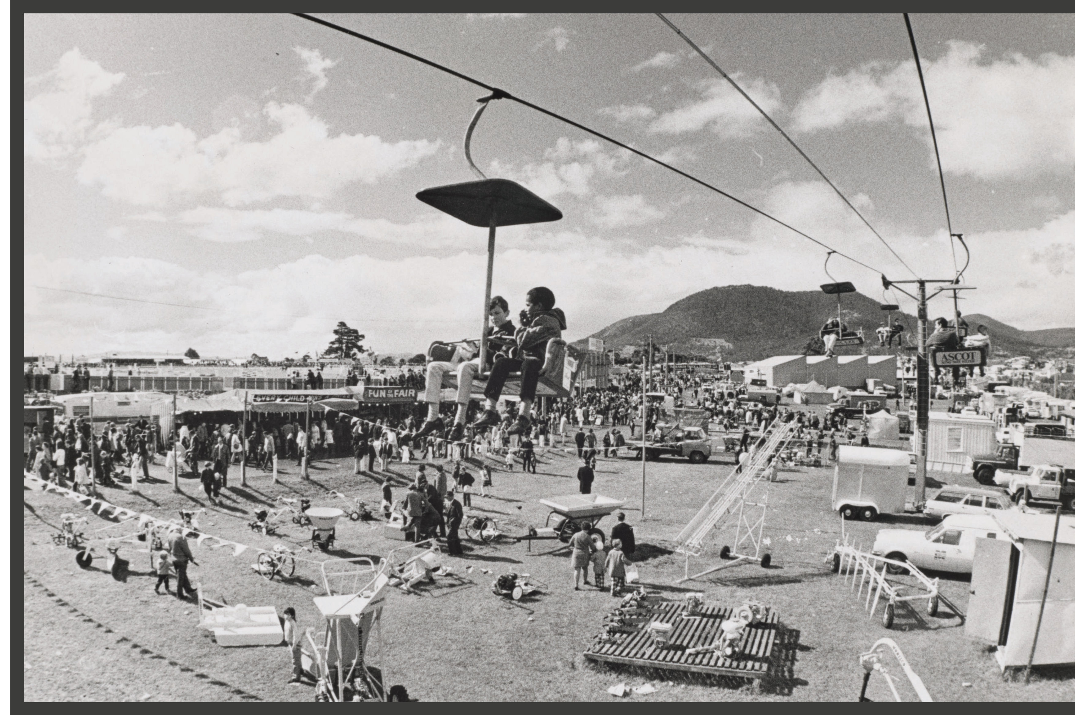
1971 CHAIR LIFT

The Society continued to hold their Annual Show despite war times.