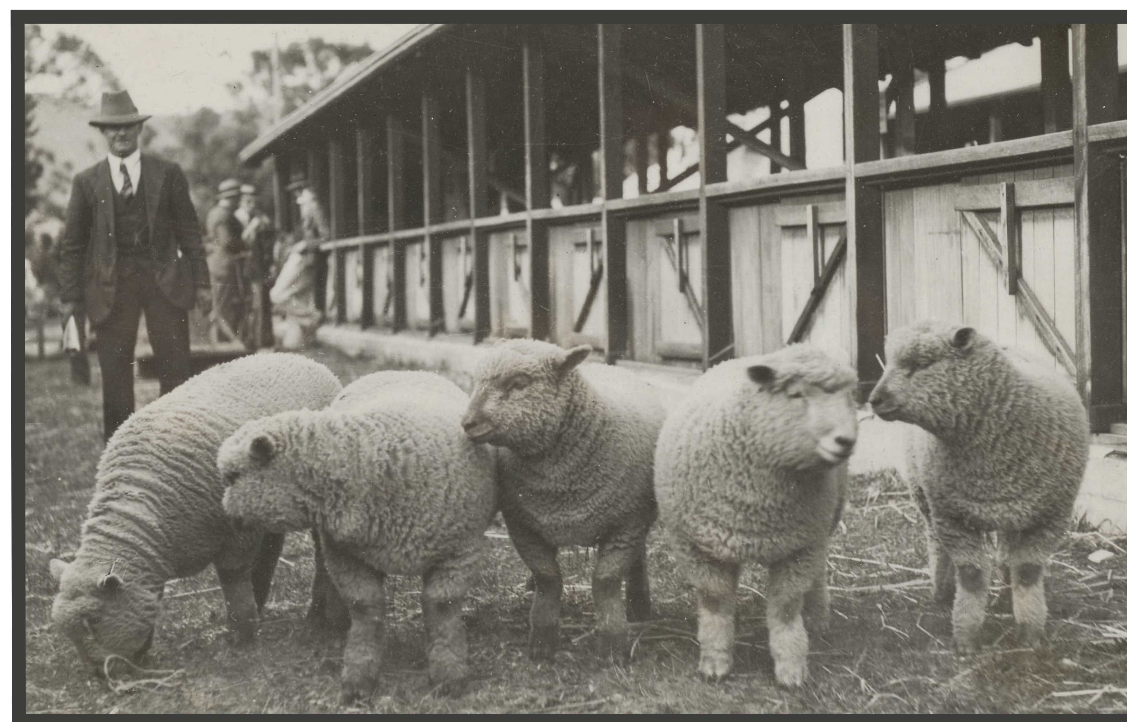
CIRCA 1859 SHEEP AT SHOW

The first spring exhibition Show of the Society was held at the Hobart Town Hall.